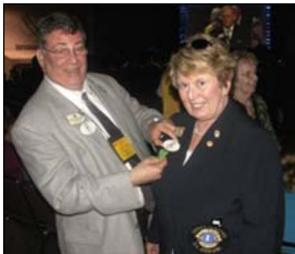
Officially installed - Green DGE ribbon removed.